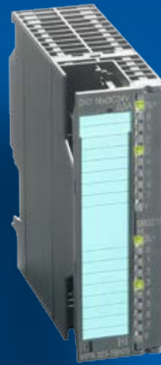
SPEED bus modules