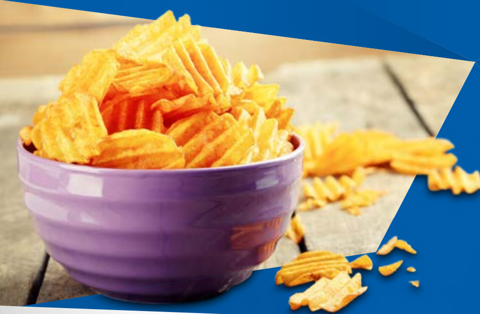
Chips FROM the assembly line