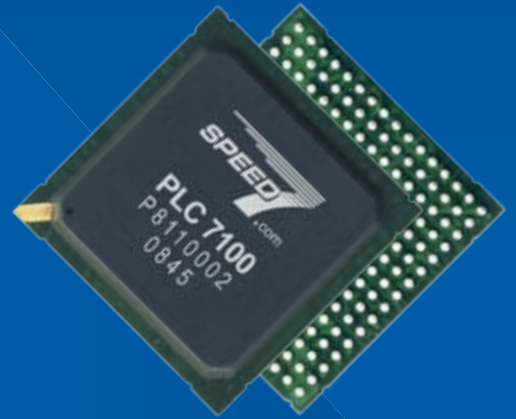
Chips FOR the assembly line