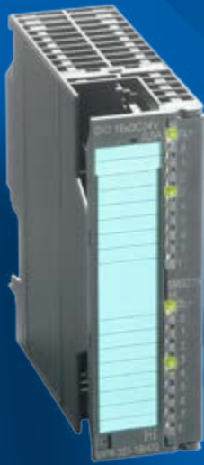
Standard bus modules